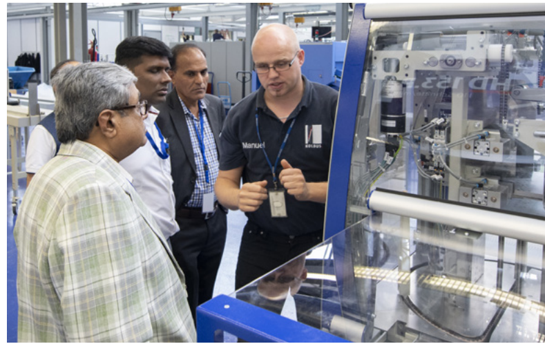
Customers from around the world watch demonstrations of the latest machines in the Blue Salon.

The Blue Salon contains 30 Kolbus machines – spread across seven different systems: three softcover lines (KM 610A/8,000 cycles/hour, KM 412E/18,000 cycles/hour, KM 200/digital print finishing, three hardcover lines (BF 513/30 cycles/minute, BF 530/70 cycles/minutes, EMP 513/30 cycles/minute) and one backgluing line (RF 700). “This allows us to cover 75% of the Kolbus brand equipment range,” says Manuel Seewald, Head of the Blue Salon.